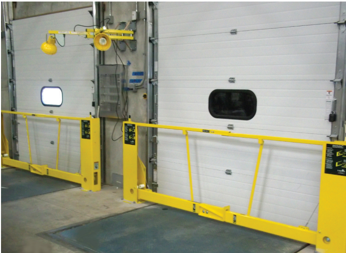
Prevents damage to overhead door tracks and panels

"The NOVA Dock Sentinel Safety Gate is a manually operated gate style barrier. When dock use is required, the NOVA Dock Sentinel Safety Gate is opened by simply lifting the gate into an upright position until latched with very little effort. When dock use is finished, each side of the gate is unlatched and lowered back to the closed position."