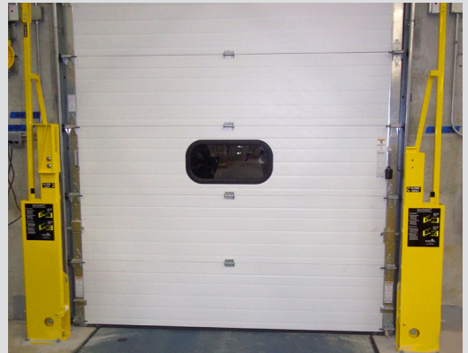
When open, gate provides full door width pass-thru clearance