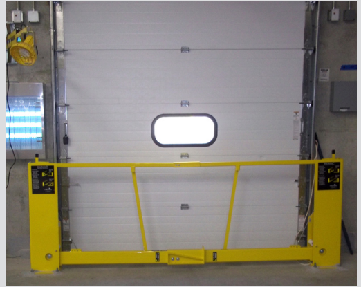
Provides three functions in one—dock door protection, door track protection, and pedestrian protection.