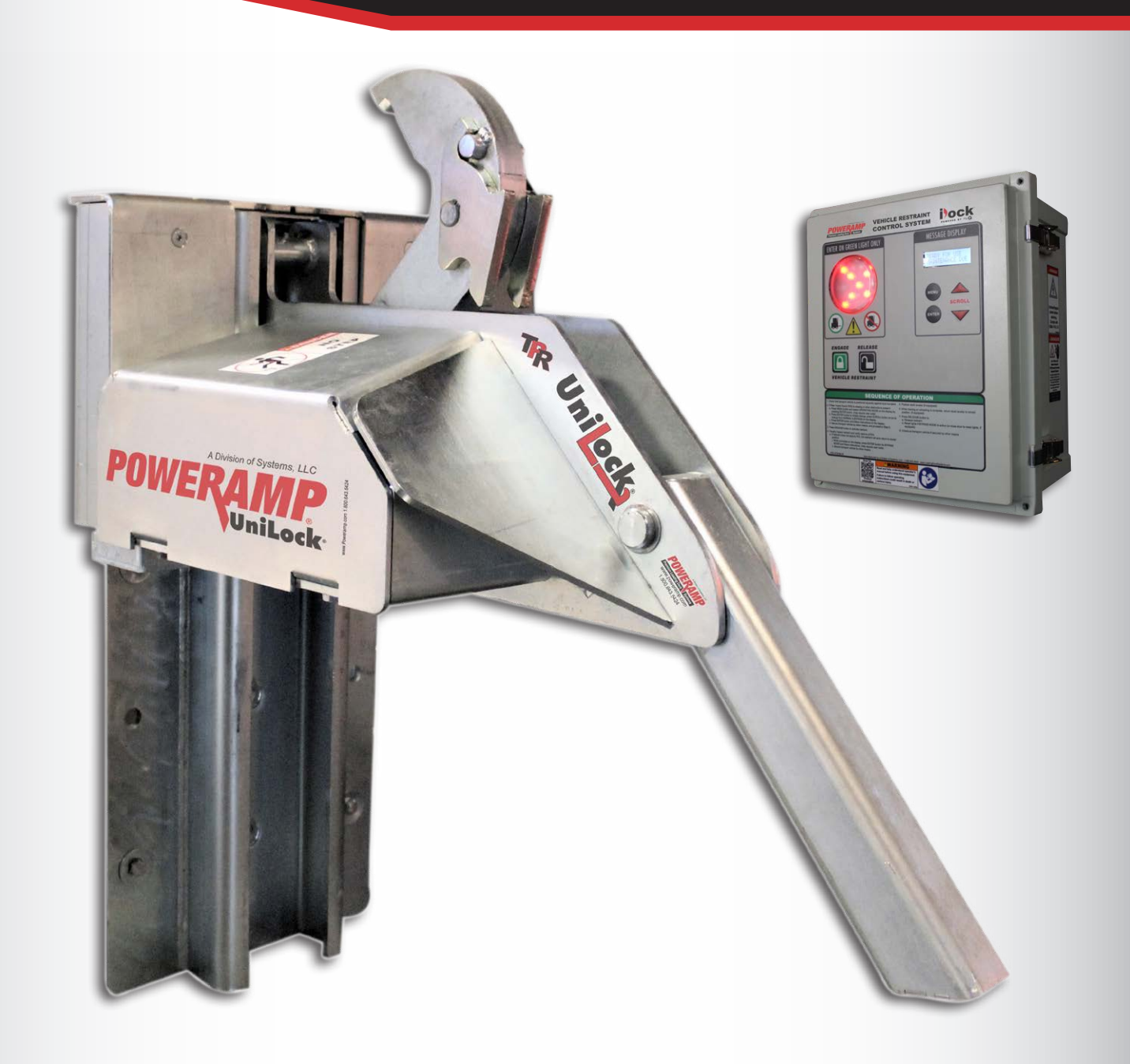
* TPR UniLock® shown with advanced iDock Controls. Patent Pending.