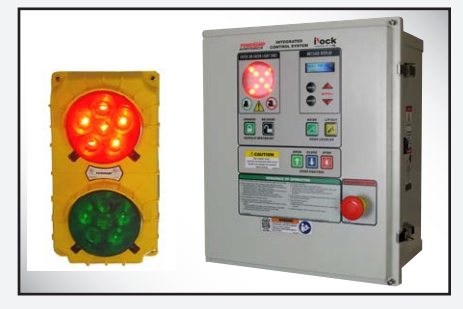
iDock® Controls includes light communication and can be integrated with other dock equipment.