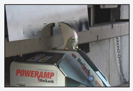
Locking mechanism maintains engagement even on intermodal trailers or an obstructed Rear Impact Guard (RIG).