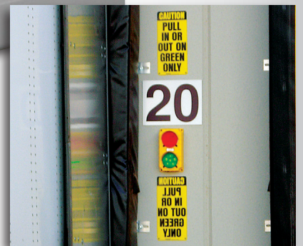
* iDock Alert controls shown with optional dock light button.