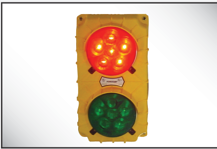
Exterior Lights - LED for longer life.