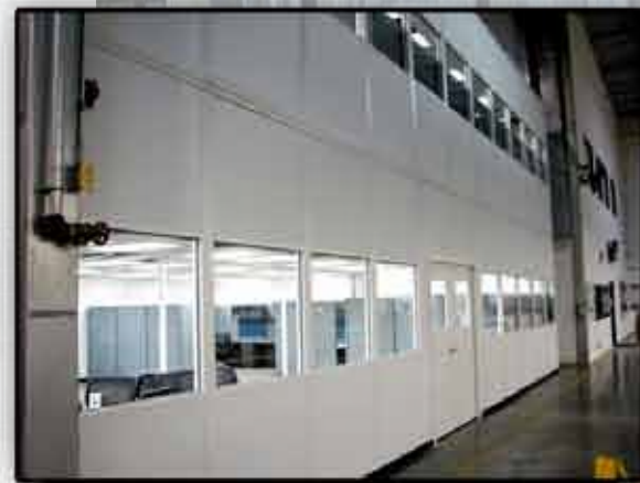
2 STORY OFFICES