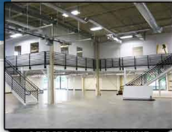
OFFICES ON MEZZANINE

Creating critical environments to house various processes is a key to competing in the manufacturing world today. PortaFab can provide environmental control to paint processes, printing and packaging operations, machine enclosures and labs. Gain a competitive advantage and improve throughput at your facility with a custom-built environmental enclosure from PortaFab Modular Building Systems.