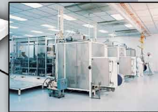
INJECTION MOLDING ROOMS