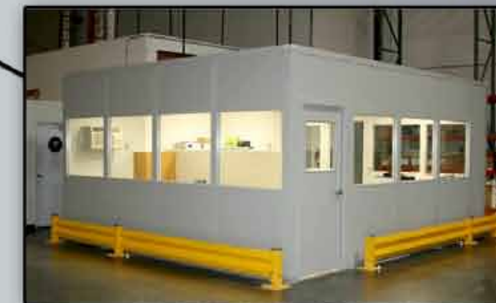
5 DAY "QUICK SHIP" OFFICES